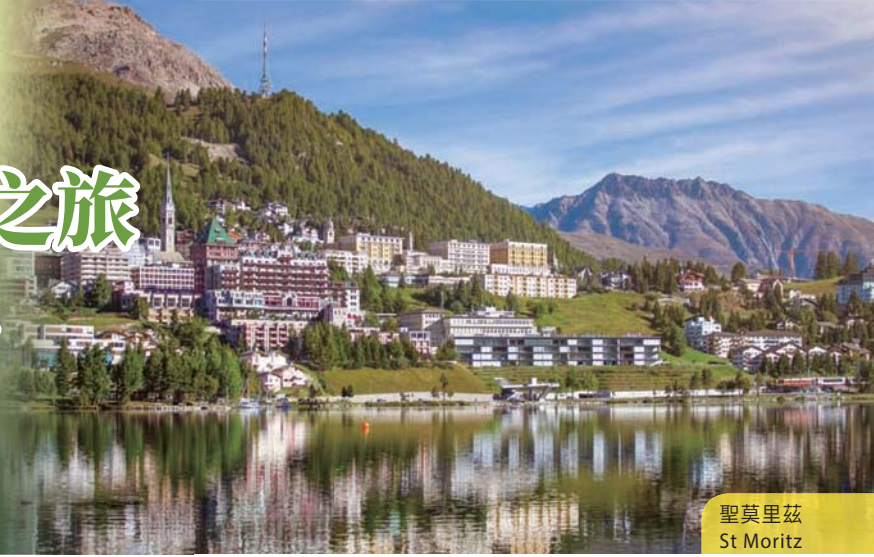
聖莫里茲 St Moritz

暢遊：蘇黎世、伯恩、日內瓦、采爾瑪特、利德阿爾卑、提契諾、聖莫里茲、恩加丁山谷、瓜爾達、達沃斯 Visiting: Zurich, Bern, Geneva, Zermatt, Riederalp, Ticino, St Moritz, Engadin Valley, Guarda, Davos