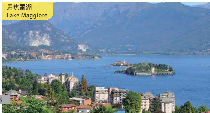
馬焦雷湖 Lake Maggiore

自助式早餐後，驅車前往 法國小鎮-Yvoire 。湖畔渡船口岸附近是舊的石頭老屋，還有滿佈爬藤的露天陽臺和古樸的街巷。稍後驅車前往 蕾夢湖南岸的艾維昂 ，這裡最著名的莫過於 源自阿爾卑斯山脈的Evian礦泉水 。午餐自備。餐後驅車前往塔殊轉乘火車登